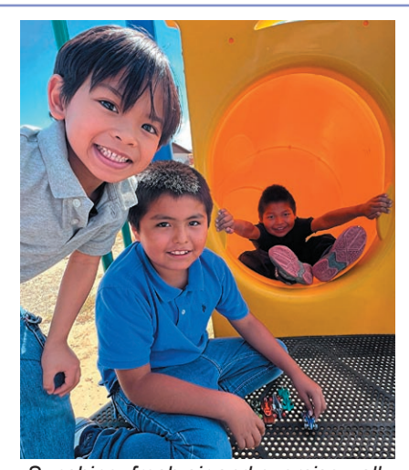
Sunshine, fresh air and exercise - all part of a healthy life for our students.